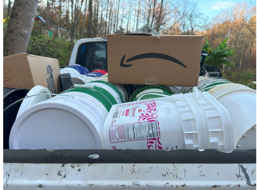
PI's pick up full of buckets and filters & other aid