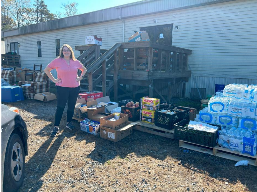
Church of God staging area for assistance to be brought to Spruce Pine